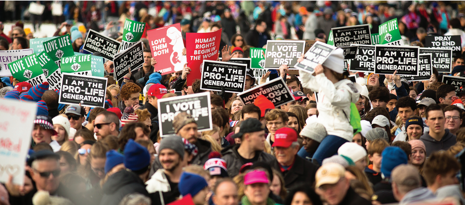
People gather during the annual March for Life rally in Washington Jan. 24, 2020.

The Spiritual Exercises and Ignatian discernment lie at the heart of the Jesuit mission. All our works are grounded in the Ignatian spiritual tradition and seek, in their own way, to show the way to God. As Pope Francis wrote in his letter confirming the UAPs, "Without this prayerful attitude, the other preferences will not bear fruit." So, prayerful contemplation of our context is where we start when we reflect on political participation from an Ignatian perspective.