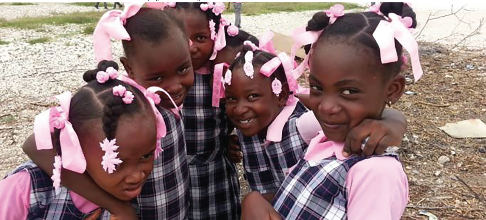
Students of the Foi et Joie Haiti education program.

Only kinship. Inching ourselves closer to creating a community of kinship such that