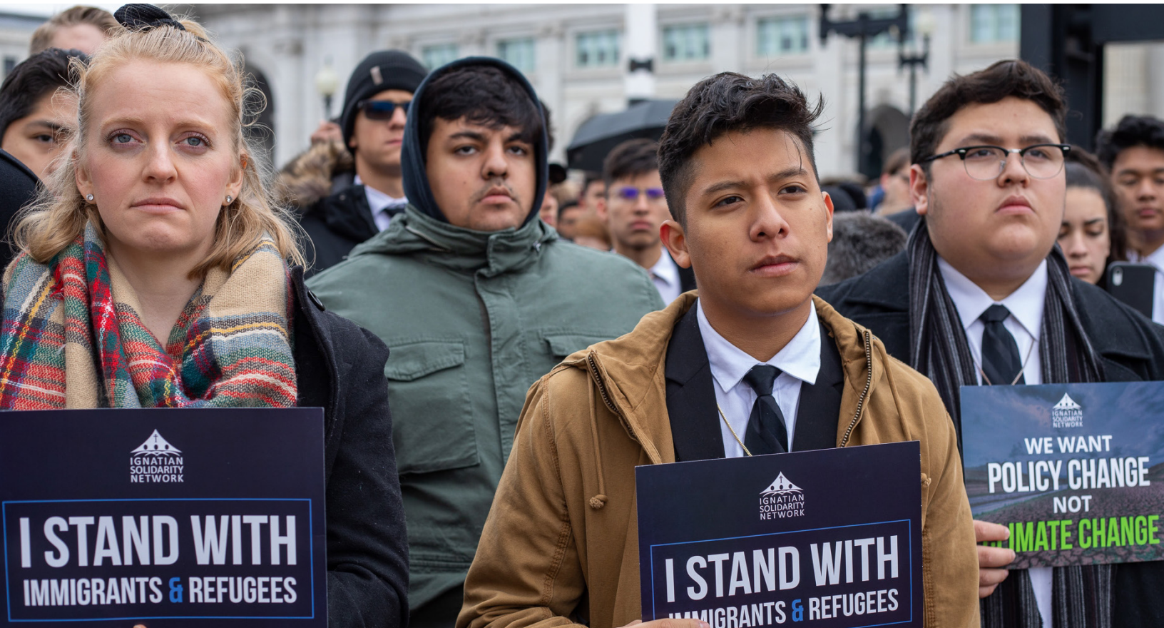
Young people gather for the Ignatian Solidarity Network “public witness” gathering near the U.S. Capitol in Washington Nov. 18, 2019. An advocacy day on Capitol Hill followed the rally, attended by 1,500 participants of a weekend teach-in on justice issues.

We hope this chance to reflect on how our Catholic, Ignatian values might influence our political participation will spark thoughtful conversation and action throughout the Society of Jesus and the broad Ignatian family.